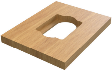
CUT HOLE IN BOTTOM